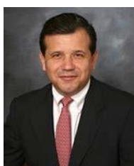
Mayor Miguel Pulido