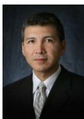
Mayor Pro Tem Vincent Sarmiento Ward 1